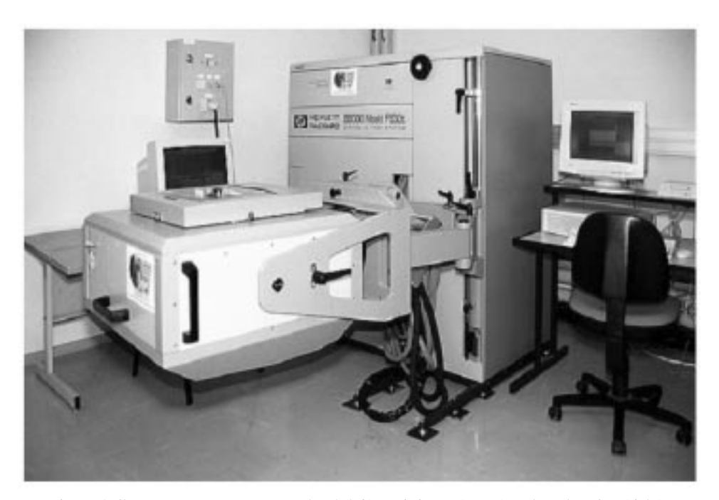
Fig. 2. Agilent 83000 F330t tester: test head (left), mainframe (centre) and workstation (right).

The next step in the course summarizes Agilent HP83000 software. The structure of test data is discussed, together with the data manager software used for test data manipulation. Basic steps in test